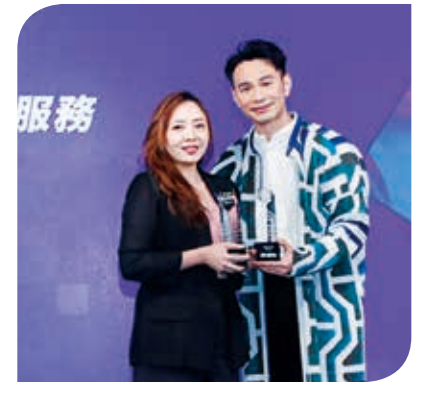
Club SIM receives the Most Favourite Mobile Service award at the iChoice Awards 2019.