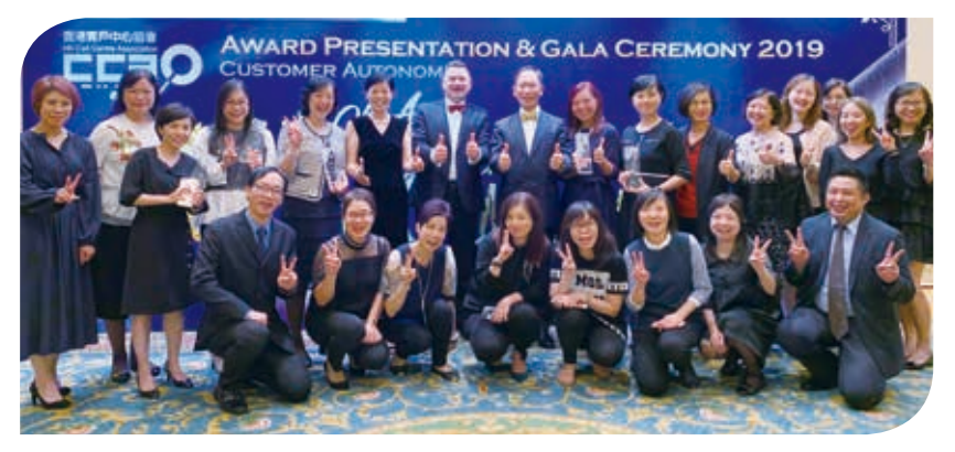
HKT sweeps a total of 60 awards at the Hong Kong Call Centre Association Awards 2019.