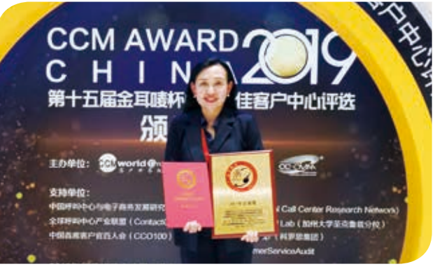
HKT Teleservices wins the CCM Award China 2019.